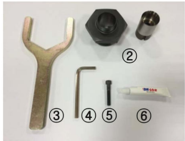
② DJS consisting of DIE and JIG ③ Ratchet Wrench ④ Allen Key ⑤ DIE Fixing Bolt ⑥ DKLUB-0311 (Lubricant)