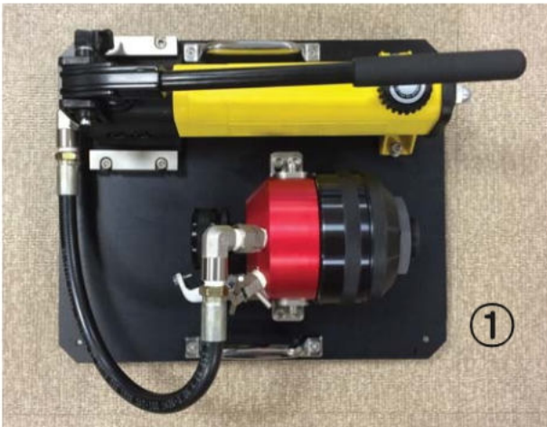
① Hydraulic Swaging Unit (Swaging Head + Hydraulic Hand Pump)